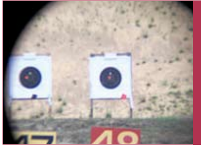
One of our V Bulls at 500yds