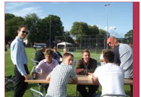
OW and School cricket teams. After the match.