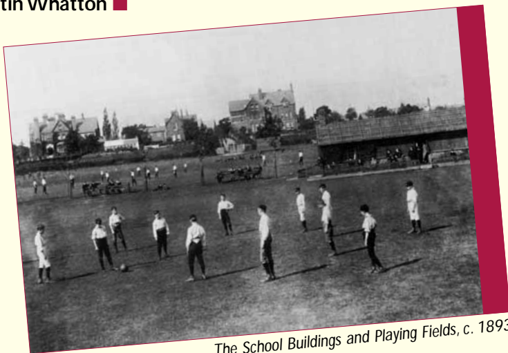
The School Buildings and Playing Fields, c. 1893