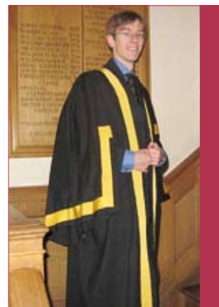
Wearing the livery gown

the Lord Mayor present and the Beating the Bounds of the parish of St Andrew by the Wardrobe in Blackfriars (this is the church that my company is affiliated with). The motorsport season is now fully underway and amongst other events I have marshalled the Tourist Trophy at Silverstone and a round of the British Touring Cars at Rockingham. This weekend sees me at Donington Park for the third Touring Car round.