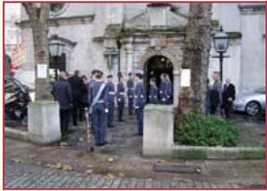
Guard of Honour by WSCCF RAF cadets